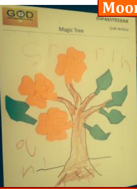
Magic tree - Raleigh