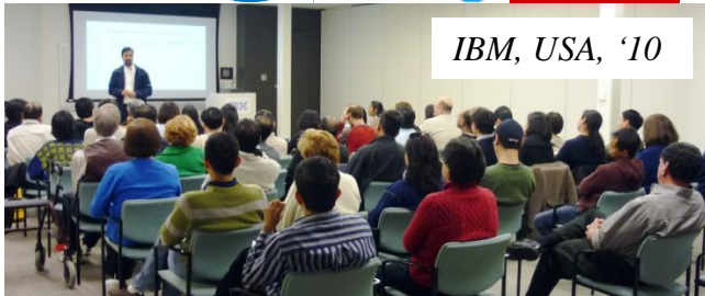
IBM, USA, '10