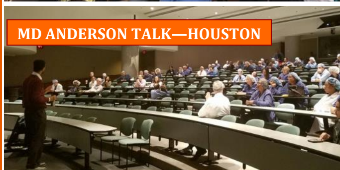
MD ANDERSON TALK—HOUSTON