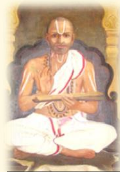
Sri Vedanta Desikan