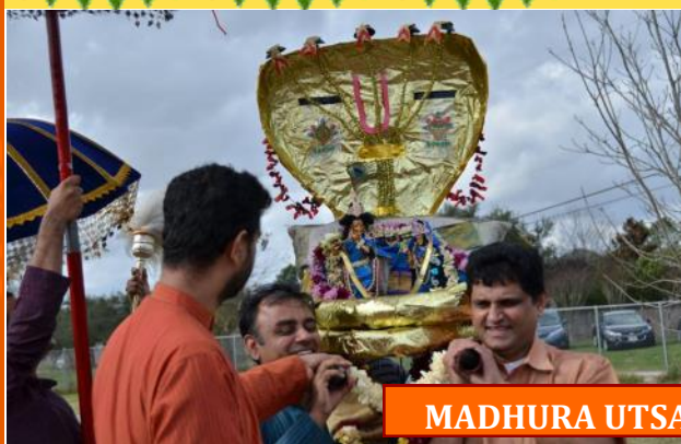
MADHURA UTSAV, HOUSTON