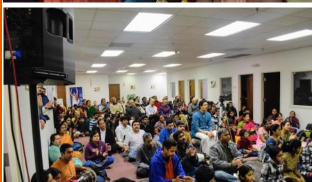
MASS PRAYER AND BHAKTI YOGA DISCOURSE SERIES—ATLANTA